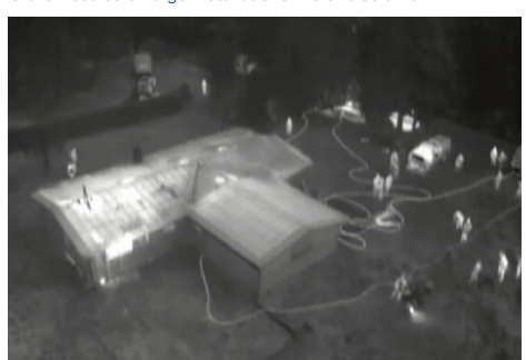
Duo Pro R is an invaluable tool for fire fighters and other